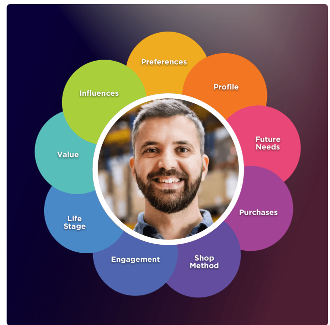
Access to Customer Data

Many retailers agree that data is the real differentiator in D2C retail. Using marketplaces like noon.com and Amazon to retail products is great because of the large customer base they have access to, but the downside is, these behemoth marketplaces own the customers and hence their data. The importance of data can't be stressed enough, but a key use case of all that complex algorithm is that it empowers retailers to customize and personalize offerings to their customers. According to a study by InstaPage , 74% of customers feel frustrated when website content is not personalised. Not having control or access means, they are now crippled from the 'ability to customize' .